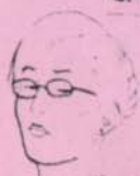
THIS IS A TEST