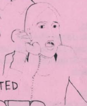
THE SEARCH FOR SIGNS OF INTELLIGENT LIFE ACROSS THE UNIVERSE