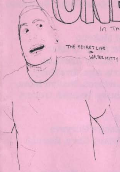
THE SECRET LIFE OF WALTER MITTY